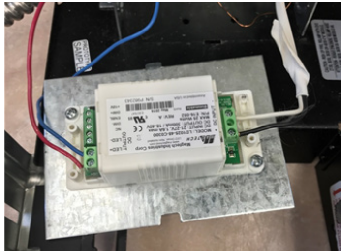
Figure G: Showing the connections of the load cable to the LED driver.