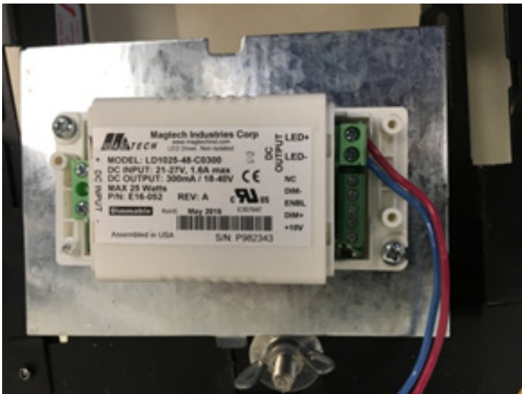
Figure D: Covers are removed from the LED driver to expose the power connections