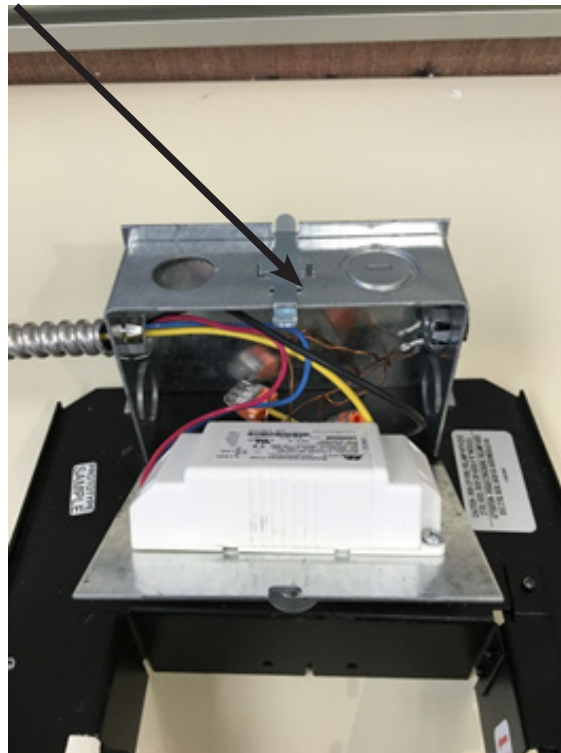
Figure B: Showing the Tab that opens and closes the front cover which holds the LED Driver.

www.audacywireless.com | 1.800.273.9989 | contactus@audacywireless.com