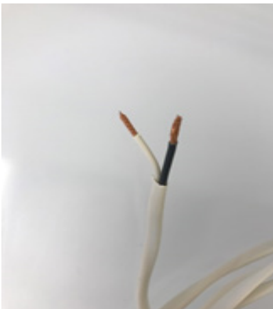
Figure E: Load Cable separating the wires that will be connected to the LED driver